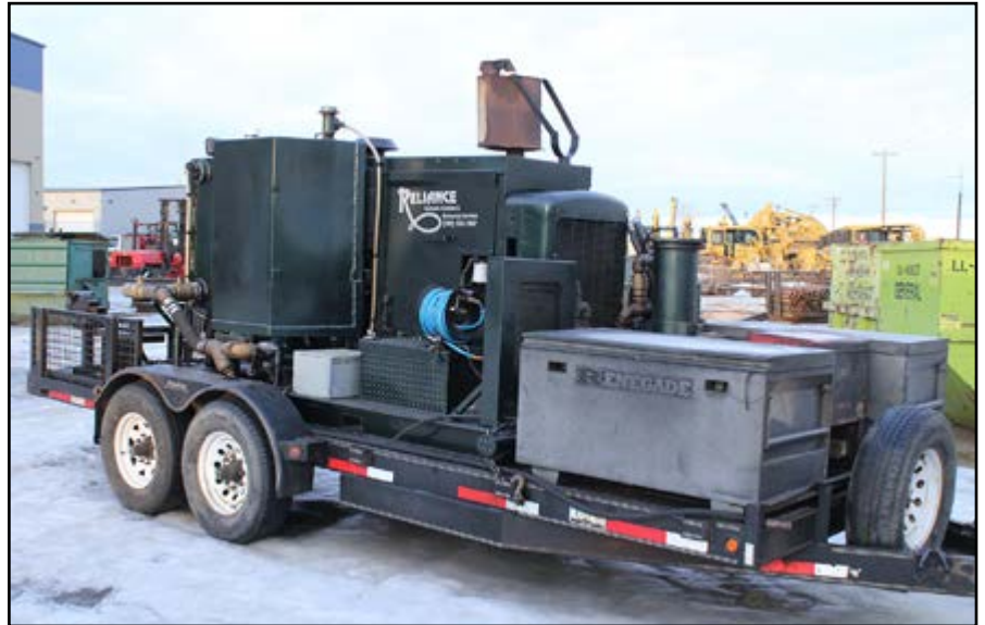
Flushing Unit consists of oilfield skid mounted on an 18-ft trailer for easy transport.