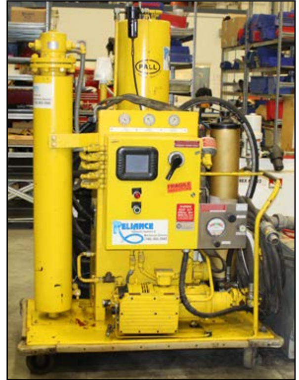
The HVP Purifier is mounted on castors for easy mobility.